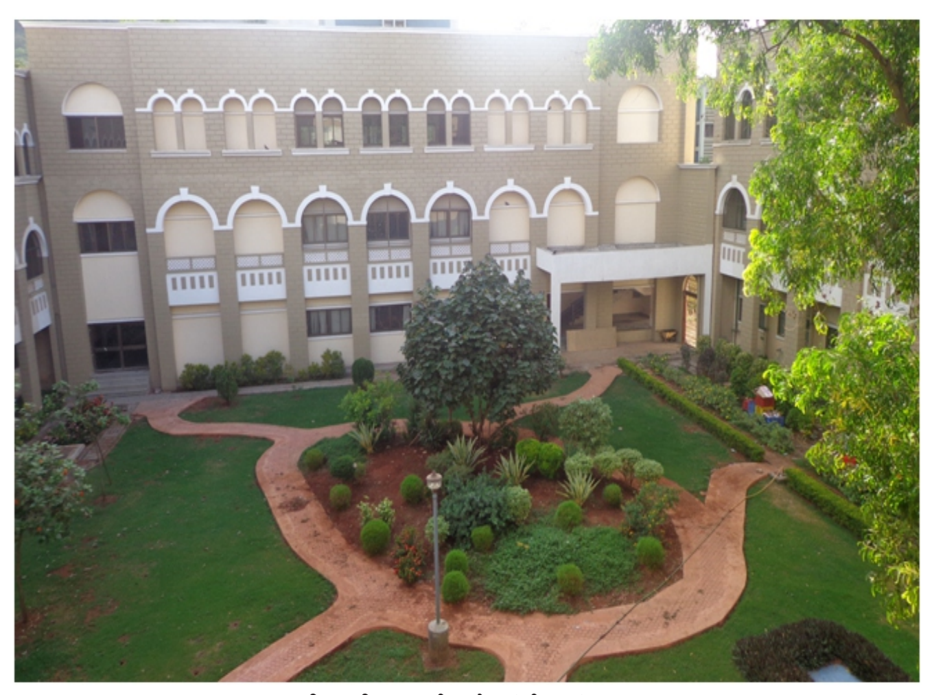
प्रशिक्षण विद्यालय परिसर के आंतरिक आंगन का दृश्य A view of inner courtyard of Training School Complex